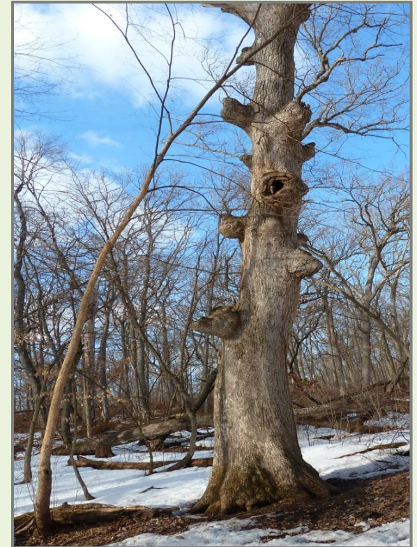
GRANDFATHER TREE - OVER 250 YEARS OLD

A guide to educational field studies led by MMSD Naturalists at the Madison School Forest